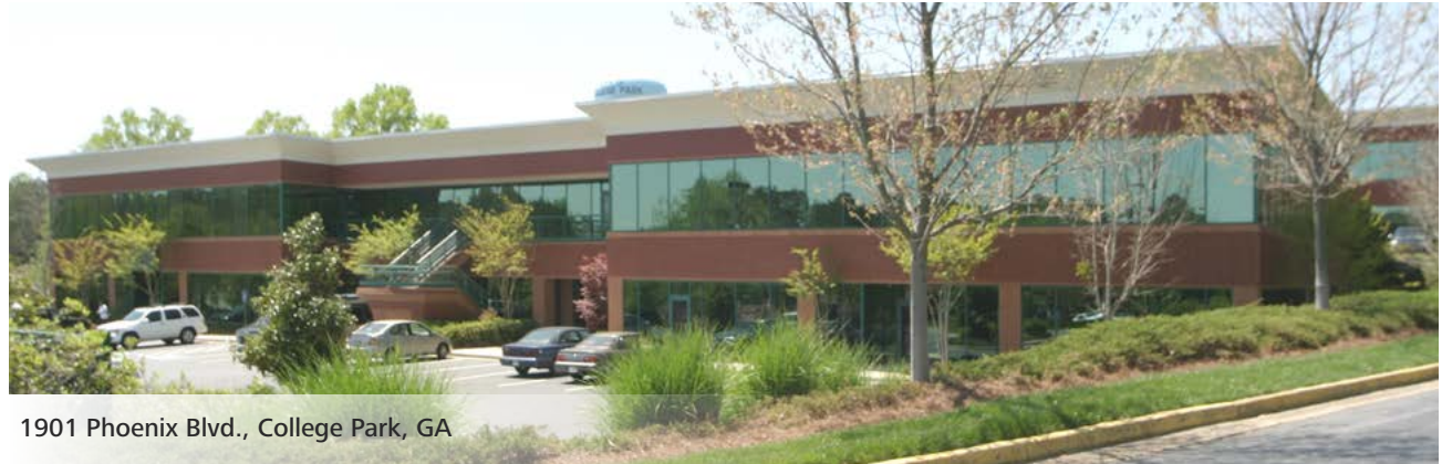
1901 Phoenix Blvd., College Park, GA

OFFICE BUILDINGS FOR LEASE 7,343 - 33,000 SF AVAILABLE