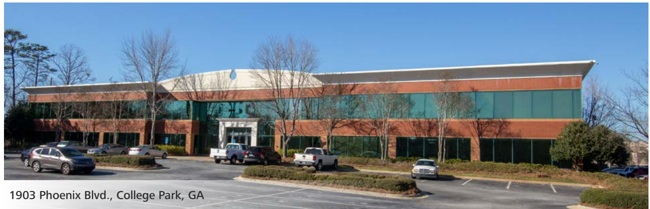
1903 Phoenix Blvd., College Park, GA